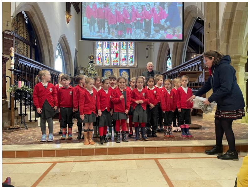
The Infant Choir performed beautifully