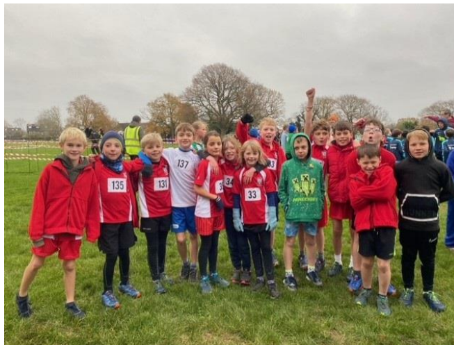
Well done to our cross country team

Congratulations to some Year 6 mathematicians, who recently entered the Primary maths challenge, which is a nationwide competition. All of those who entered, completed tasks at school and home and we are pleased to say all children achieved a silver or gold award. Well done, we are very proud of you and how hard you have worked for these awards!