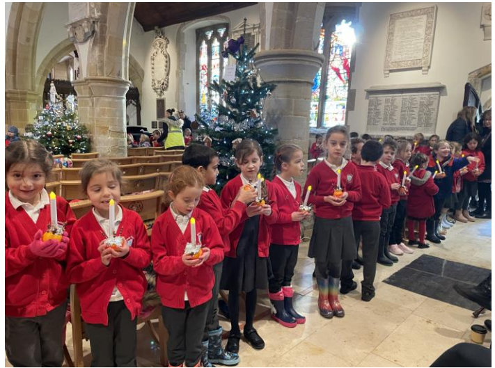
Year 2 children holding their Christingle candles