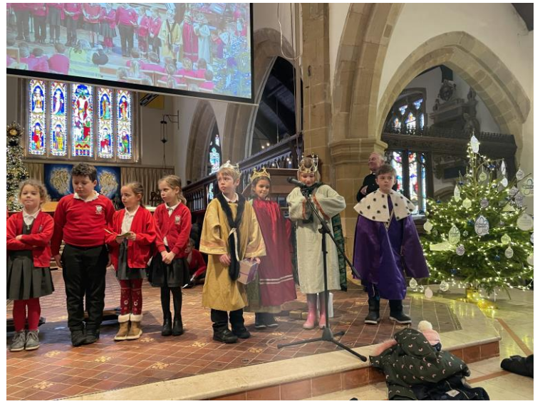
Year 3 re-enacted the Christmas Story