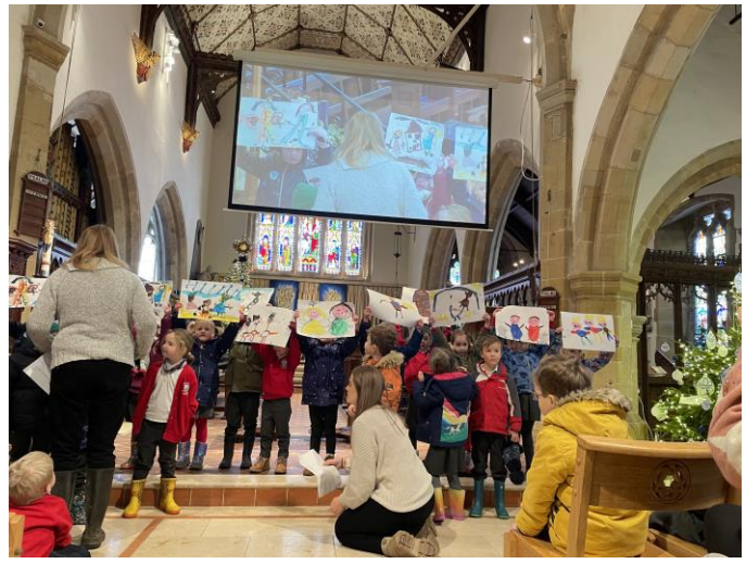
Reception children showed their paintings