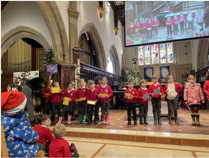
Year 1 children read the Christmas story