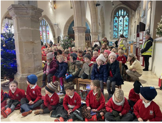
Reception & Key Stage 1 children's Christingle